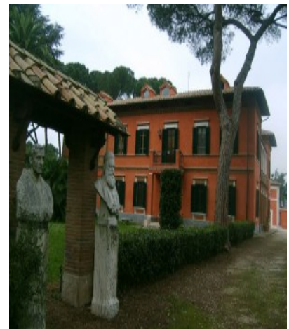
Villa Serenella Monastery

This Semester-in-Rome program is unique, not simply because of its internships but because it is the only such program in the United States that actually places interns inside the Vatican while offering guided tours of the Congregation for the Doctrine of the Faith by curial officials.