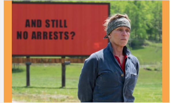
▲ Frances McDormand as Mildred Hayes in Martin McDonagh's Three Billboards Outside Ebbing, Missouri .

Date: WED, Oct 16, 2024 Time: 1:30pm - 3:00pm Location: Browne Center