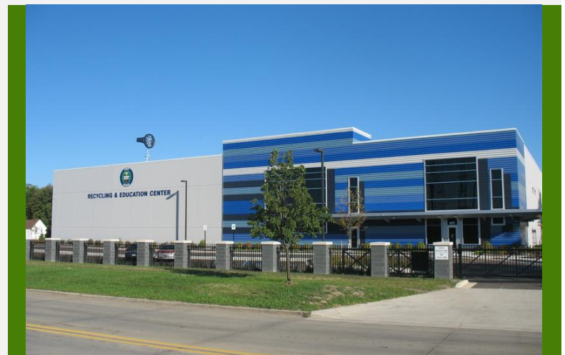
▲ The Kent County Recycling and Education Center.

Date: TUE, Oct 1, 2024 Time: 9:30am - 11:00am Location: Browne Center