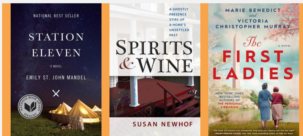
▲ Selections for the inaugural OLLI Readers Series.

Dates: THU, Sep 19, Oct 17, and Nov 21 Time: 1:30pm - 3:00pm Location: Browne Center Limit: 20