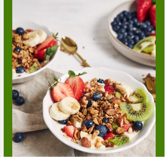
▲ A long life begins with a nutritious breakfast.

Dates: TUE, Oct 8 and 15, 2024 (2 sessions) Time: 9:30am - 11:00am Location: ZOOM