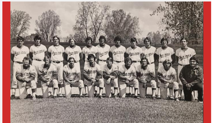
▲ The 1972-1973 Aquinas College Men's Baseball team.

Date: FRI, Sep 20, 2024 Time: 9:30am - 11:00am Location: Donnelly Center Event Fee: $0.00