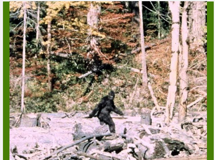
▲ A frame from the famed 1967 Patterson-Gimlin film allegedly showing Bigfoot in Northern California.

Date: TUE, Oct 22, 2024 Time: 1:30pm - 3:00pm Location: Browne Center