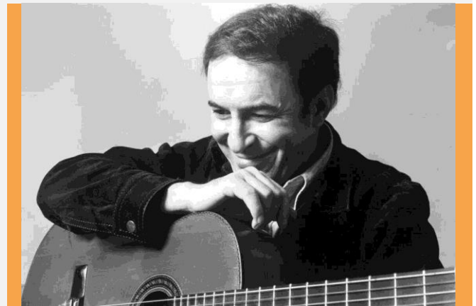
▲ The Master of Bossa Nova, guitarist João Gilberto.

Music is one of the most instantly recognizable elements of Brazilian culture. An amalgamation of indigenous South American traditions, the African diaspora, and Portuguese colonization, Brazil is the cradle of samba, bossa nova, and choro music. Explore the regions, rhythms, and religions of Brazil through a virtual tour of song and dance featuring performances by many of Brazil's leading artists, including guitarist João Gilberto, poet Vinicius de Moraes, composer Caetano Veloso, singer Clara Nunes, performer Marisa Monte, and songwriter Paulinho da Viola. View the Carnival celebrations of Bahia and Rio de Janeiro through the celebrated, yet controversial, award-winning film Black Orpheus which introduced bossa nova to the world in 1959.